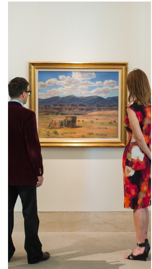
L: SHINE® Mural Festival, artwork by Michael Reeder. (c) 2017 City of St. Petersburg. C: Image courtesy of St. Petersburg Opera Company. Photographer Jim Swallow. R: Museum of Fine Arts. (c) 2016 City of St. Petersburg.