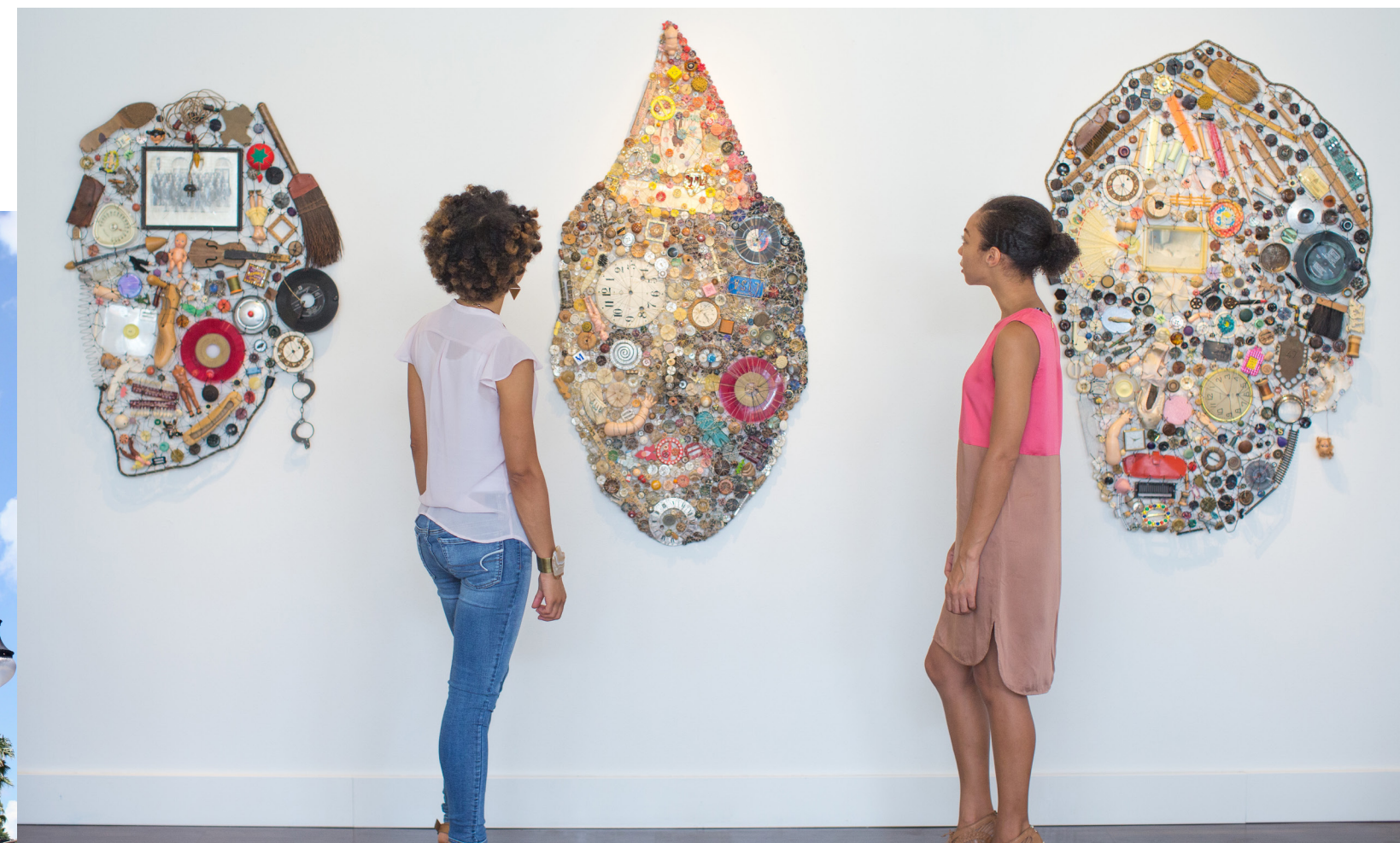
Florida Craft Arts St. Petersburg, Florida.

3.3.5 Seek project-based funds from the State of Florida and the National Endowment for the Arts. Engage professional lobbying services to promote arts funding.