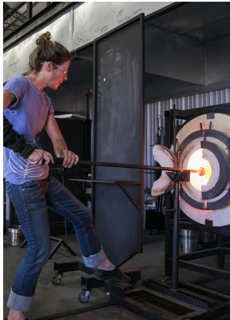
St. Petersburg Hot Glass Studio at Duncan McClellan Studios.