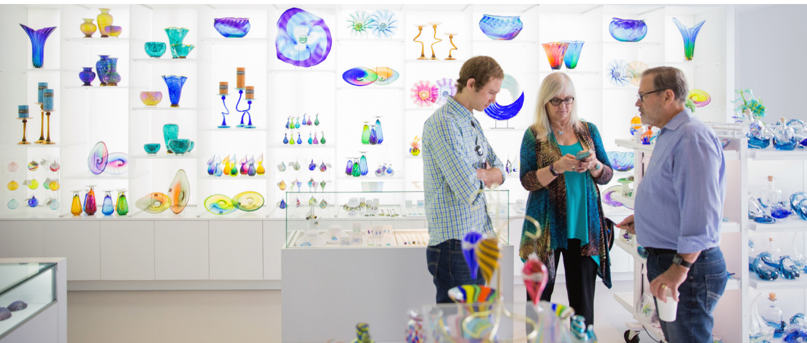
Imagine Museum in St. Petersburg Florida.