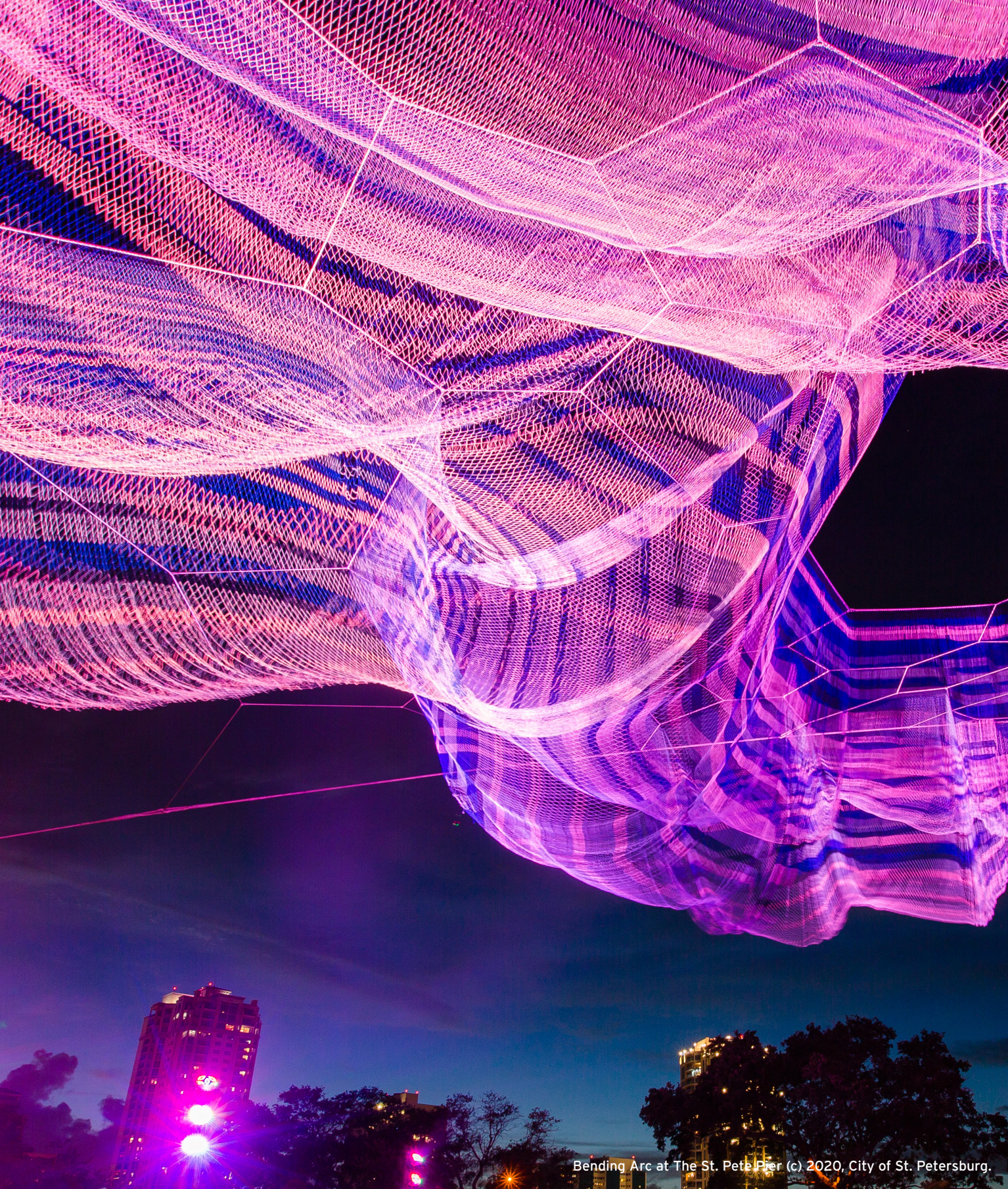
Bending Arc at The St. Pete Pier (c) 2020, City of St. Petersburg.