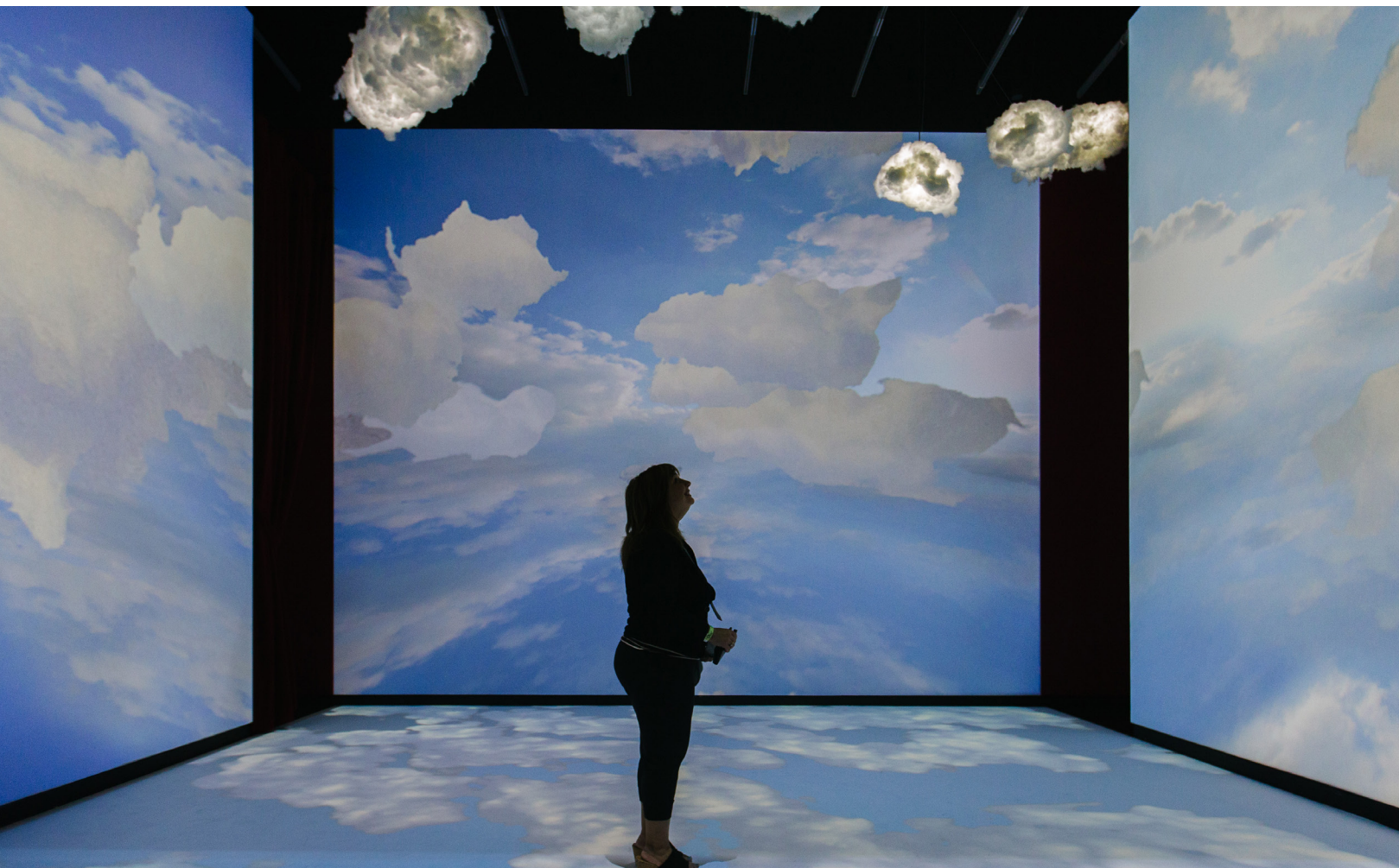
The Dali Museum: Magritte & Dali Exhibit.

The next section shares the Leadership and Funding Strategy's objectives and actions.