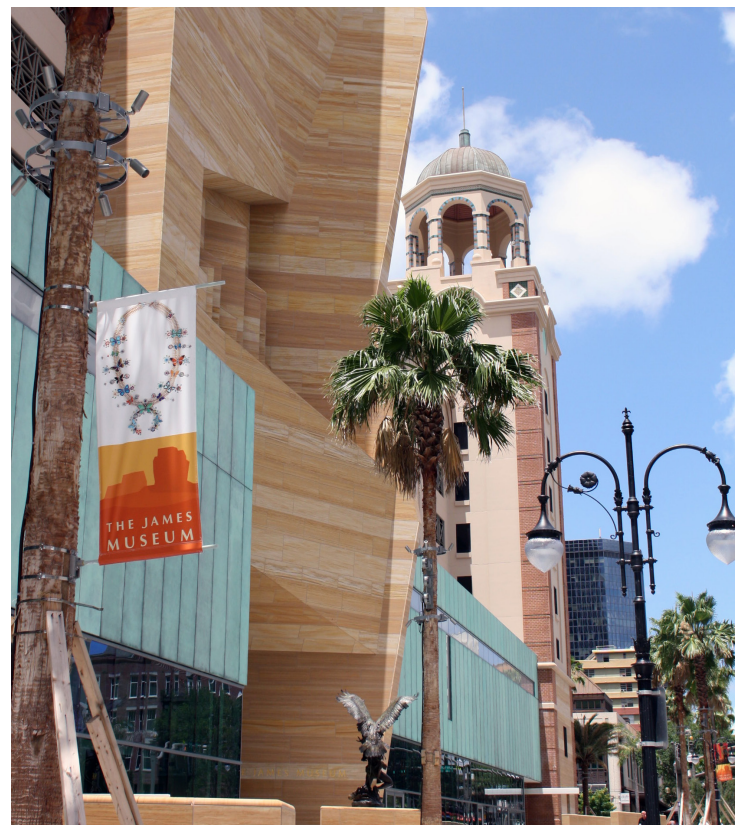
James Museum of Western and Wildlife Art.

3.2.4 Encourage museums and galleries to showcase minority and female artists, as well as to educate curators and collectors to advance minority and female artists.