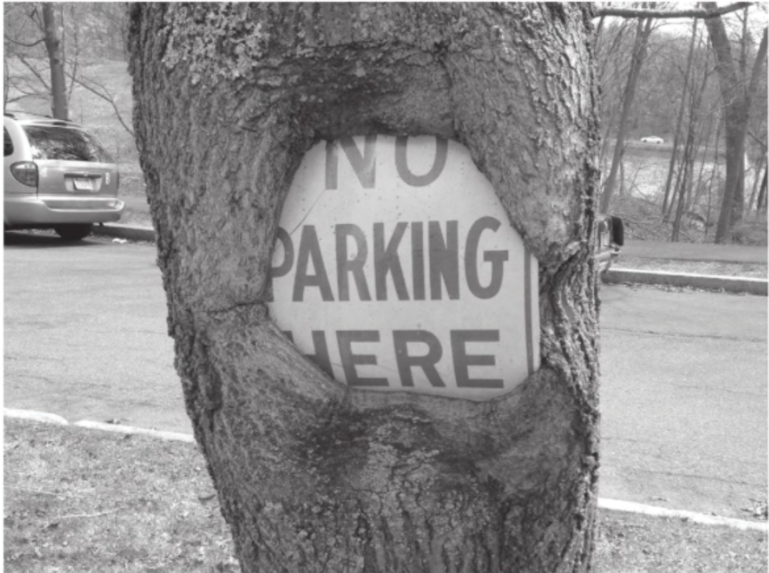
Figure 1-4. “Set it and forget it” parking management

for a rotisserie cooker that says it best. The pitchman implored the audience to “Set it and forget it,” emphasizing ease of use in roasting a chicken. Frequently, public officials take a similar approach. They “set it” through high parking requirements or expensive public parking projects—and set it so high that there will never be a parking shortage—that way, they can “forget it” when it comes to parking management. “Set it and forget it” seems to have reached a new level in figure 1-4. Most cities do not leave parking signs so long that trees grow around them, but travel around your community and consider how long some parking regulations have been in effect with no change, despite the fact that land uses, demographics, travel patterns, and parking use change in a dynamic fashion. Programs to share parking, to coordinate between land uses, or to price parking are ignored. This impulse is understandable in both parking and cooking chicken—but this approach to parking lies at the center of livability problems in many communities. Seeking to “outsupply” parking use is a recipe for bad planning outcomes.