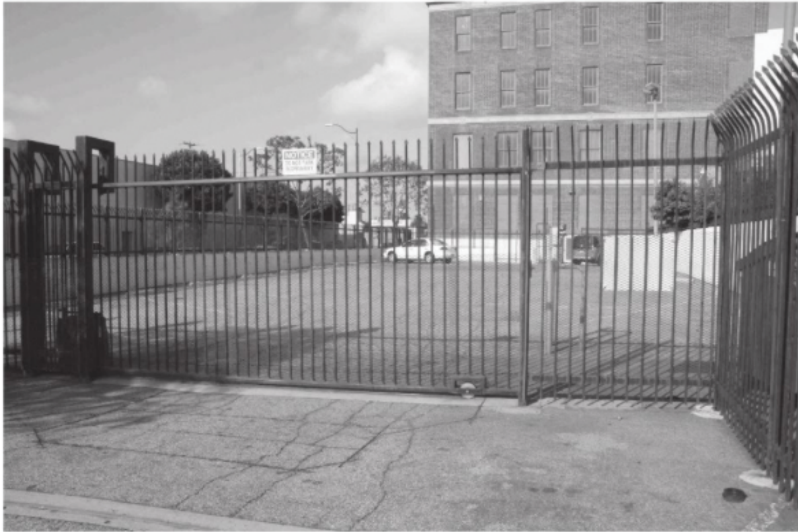
Figure 1-8. Wasted shared parking opportunity