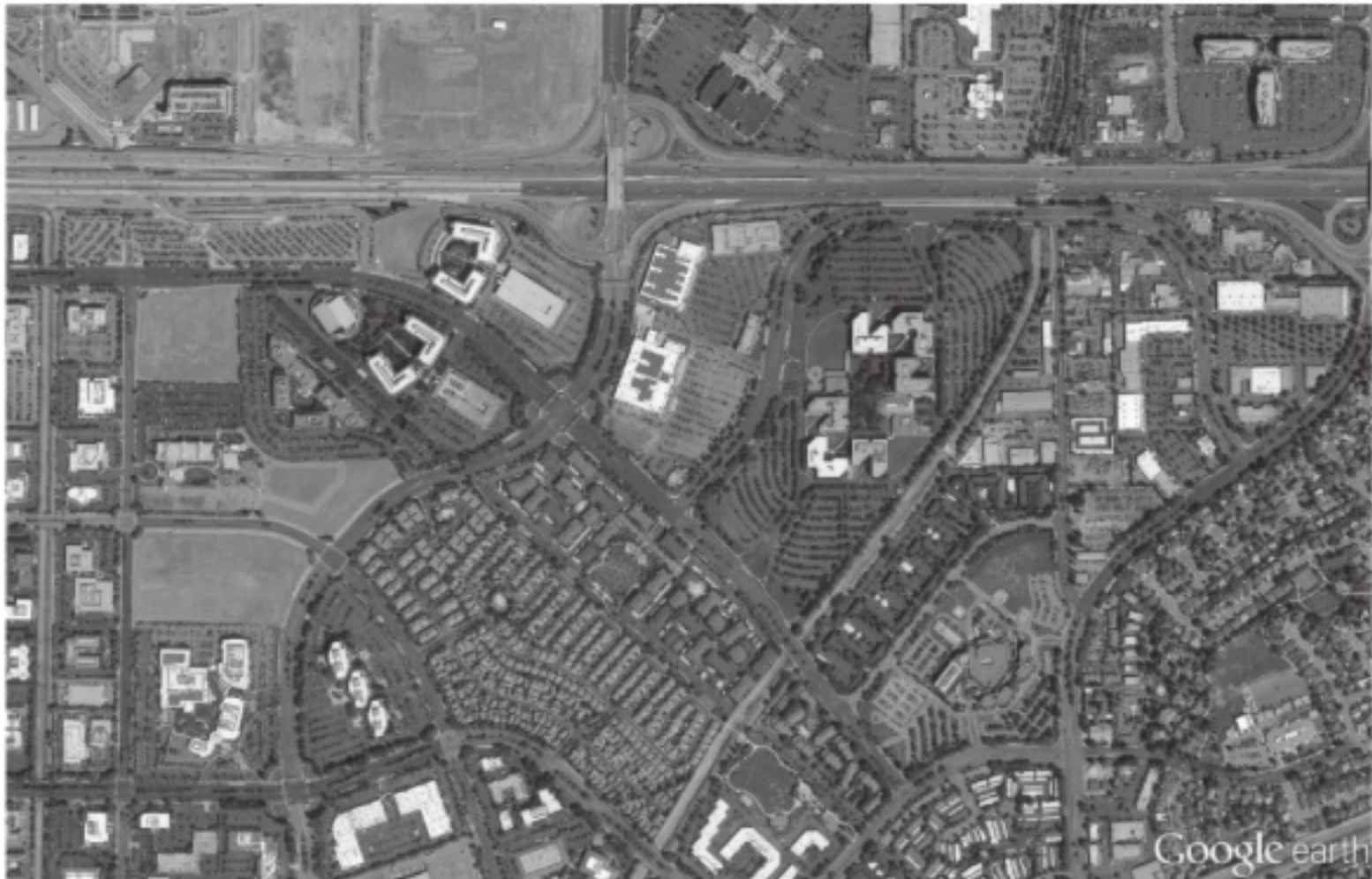
Figure 1-6. The wastefulness of exclusive parking in Pleasanton, California