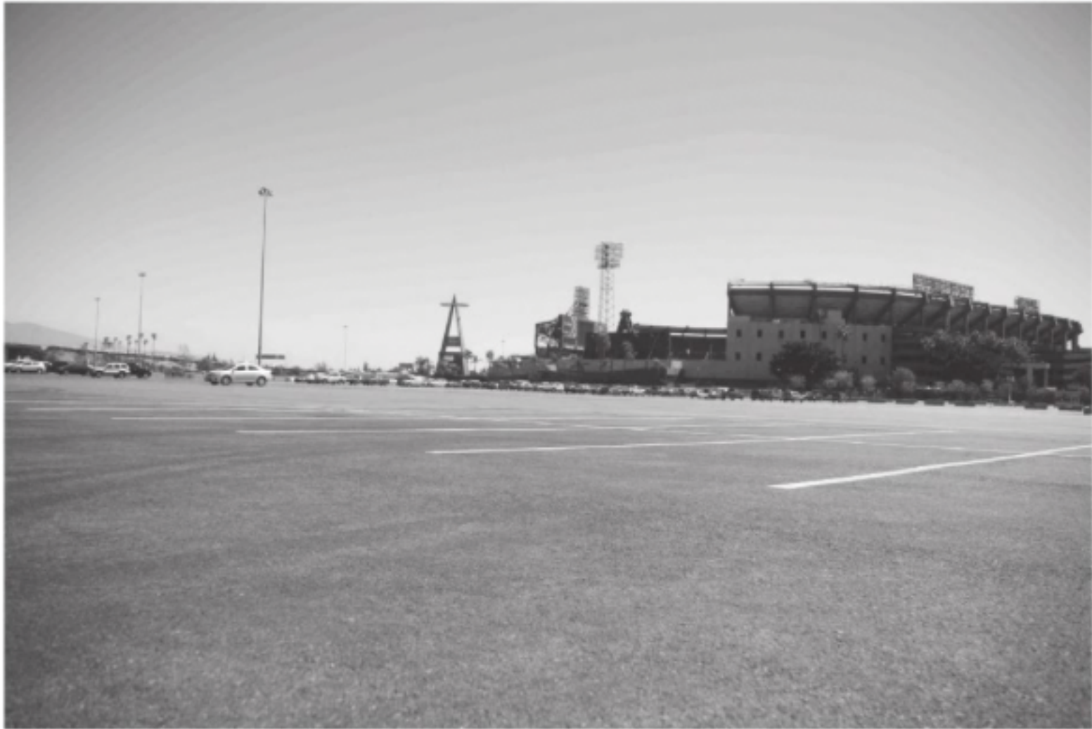
Figure 1-1. Wasted spaces at Angel Stadium of Anaheim, in Anaheim, California