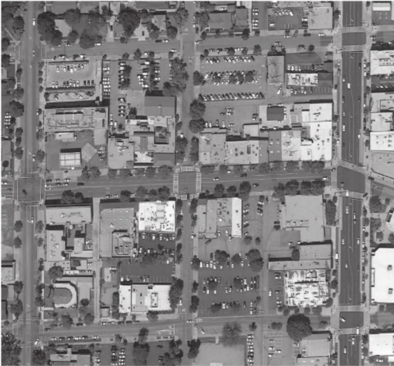
Figure 1-7. Shared parking in South Pasadena, California

backlash. The lack of shared parking agreements produces an artificial parking shortage. Figure 1-8 shows a typical lost opportunity—an off-street lot closed off to daytime users with a gate and a no parking sign.