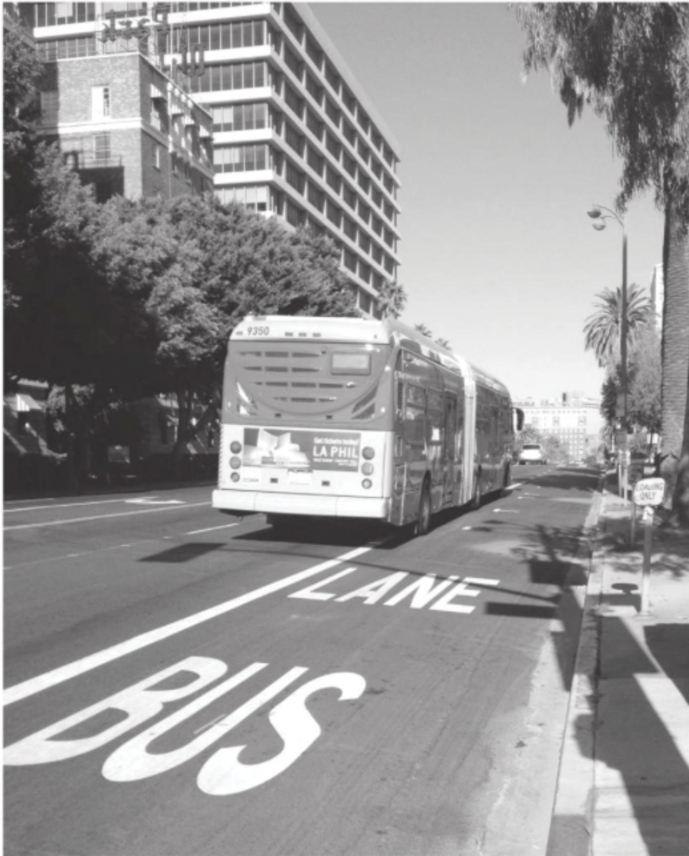
Figure 1-5. Peak-hour bus lanes as a better use of curb parking in Los Angeles, California